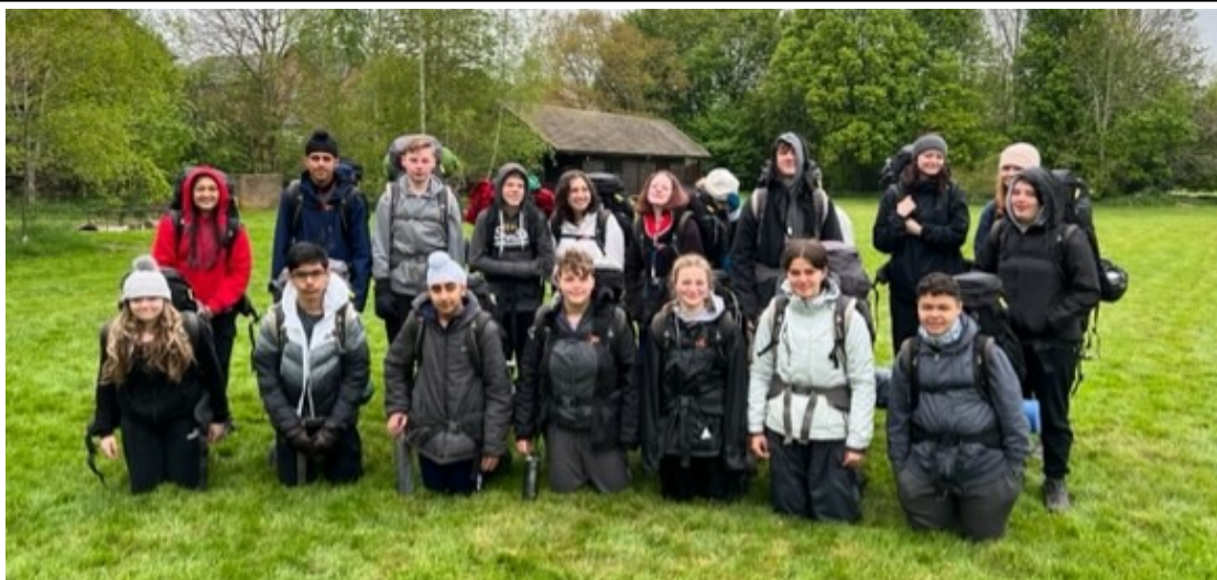
Pictured above, Y11 pupils are well-prepared for the challenges ahead.

At Campion, pupils in Years 9 to 11 have the opportunity to take part in the Duke of Edinburgh Award Scheme (Bronze and Silver Levels). The award is highly-regarded by universities and employers alike, as it demonstrates the